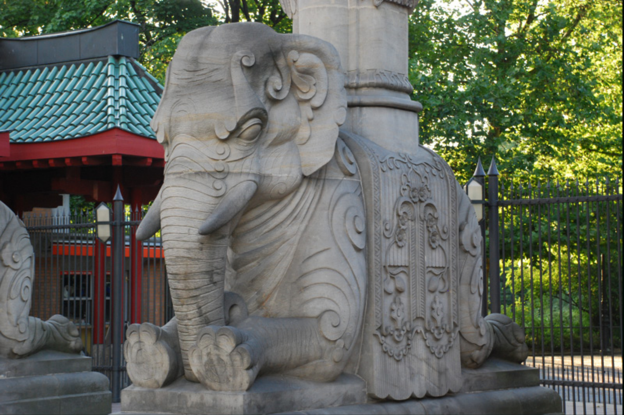
Guardian of the gate to the Zoo