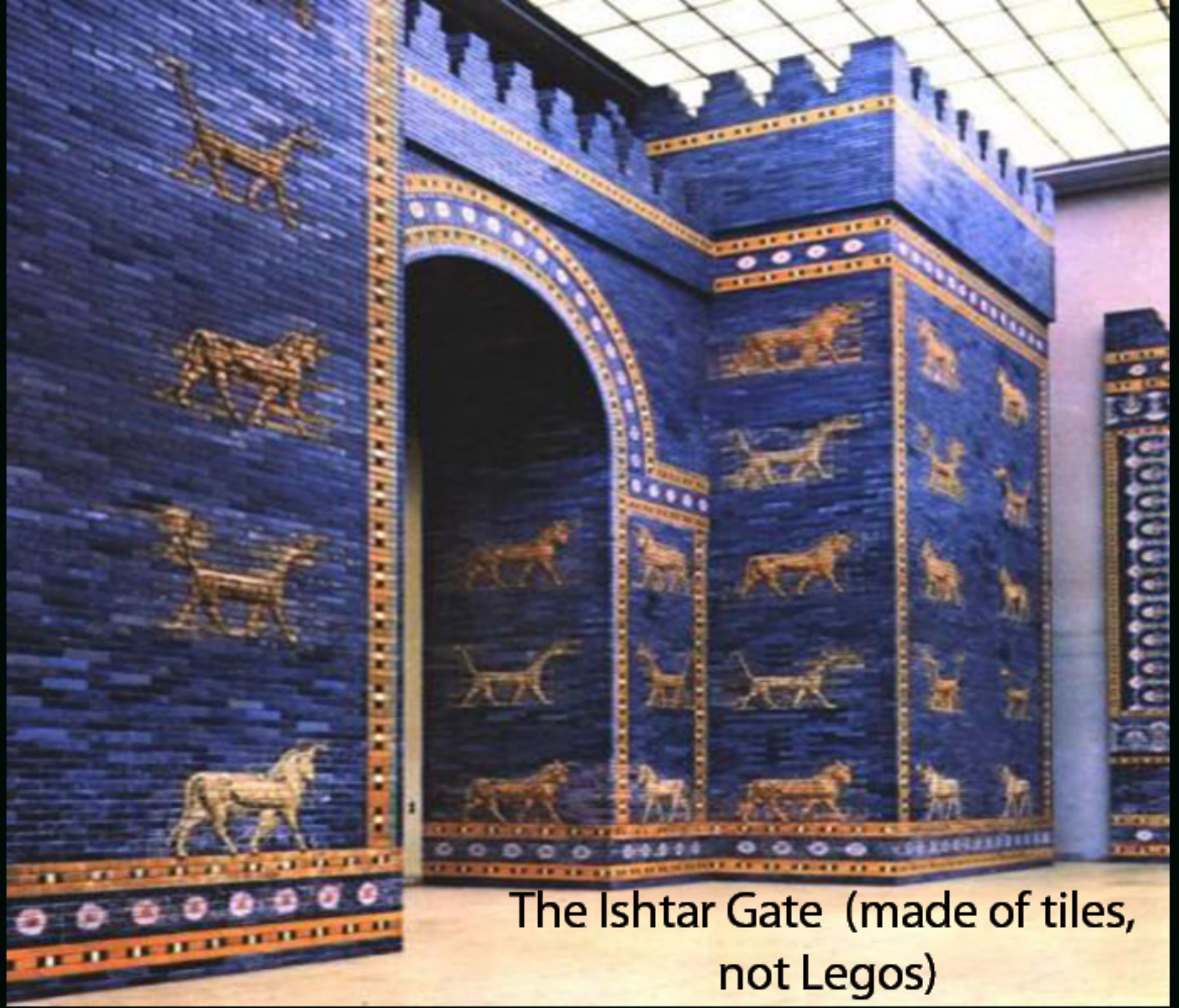
The Ishtar Gate (made of tiles, not Legos)