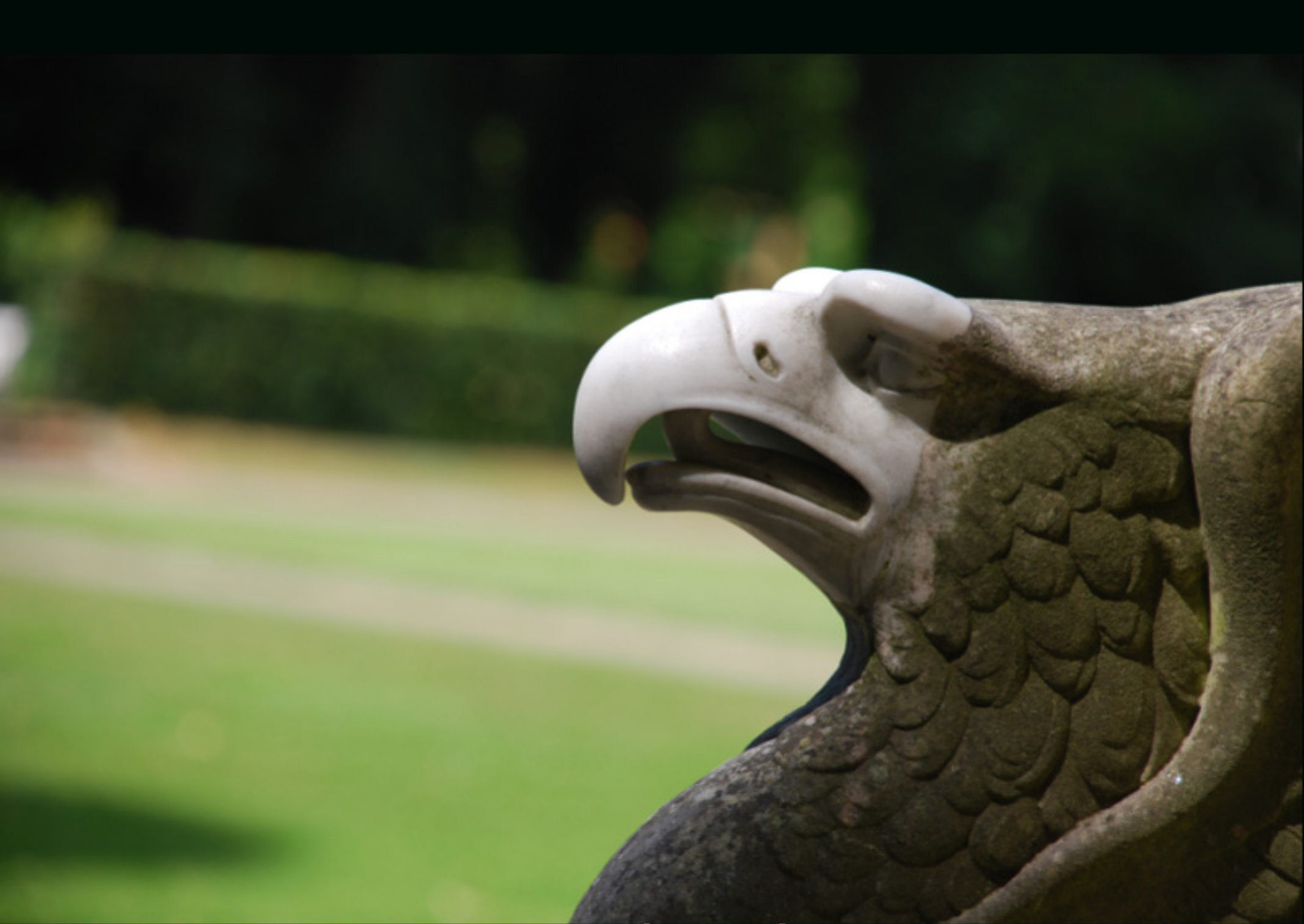
On a stone bench