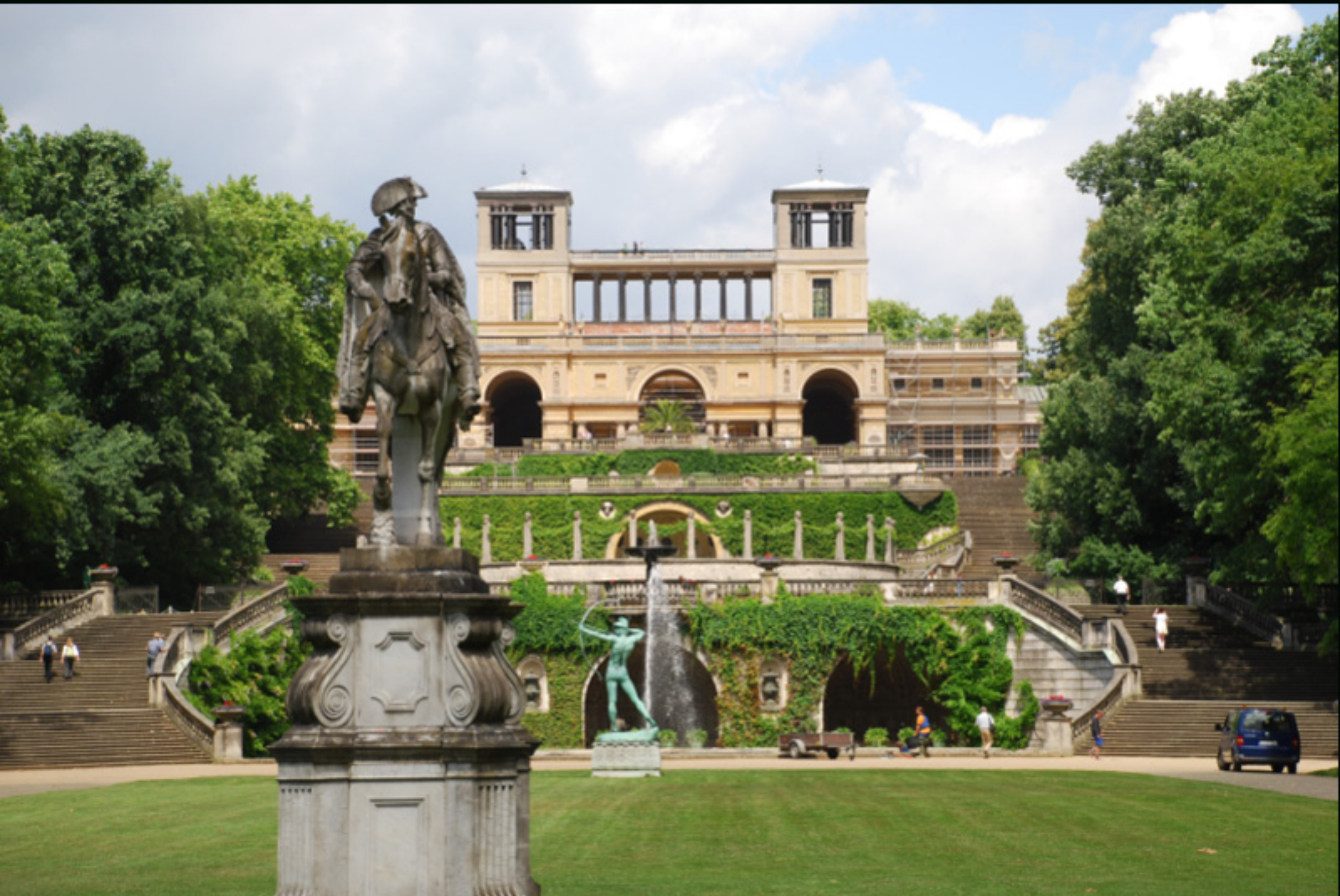
The orangerie, where plants would be taken to over-winter