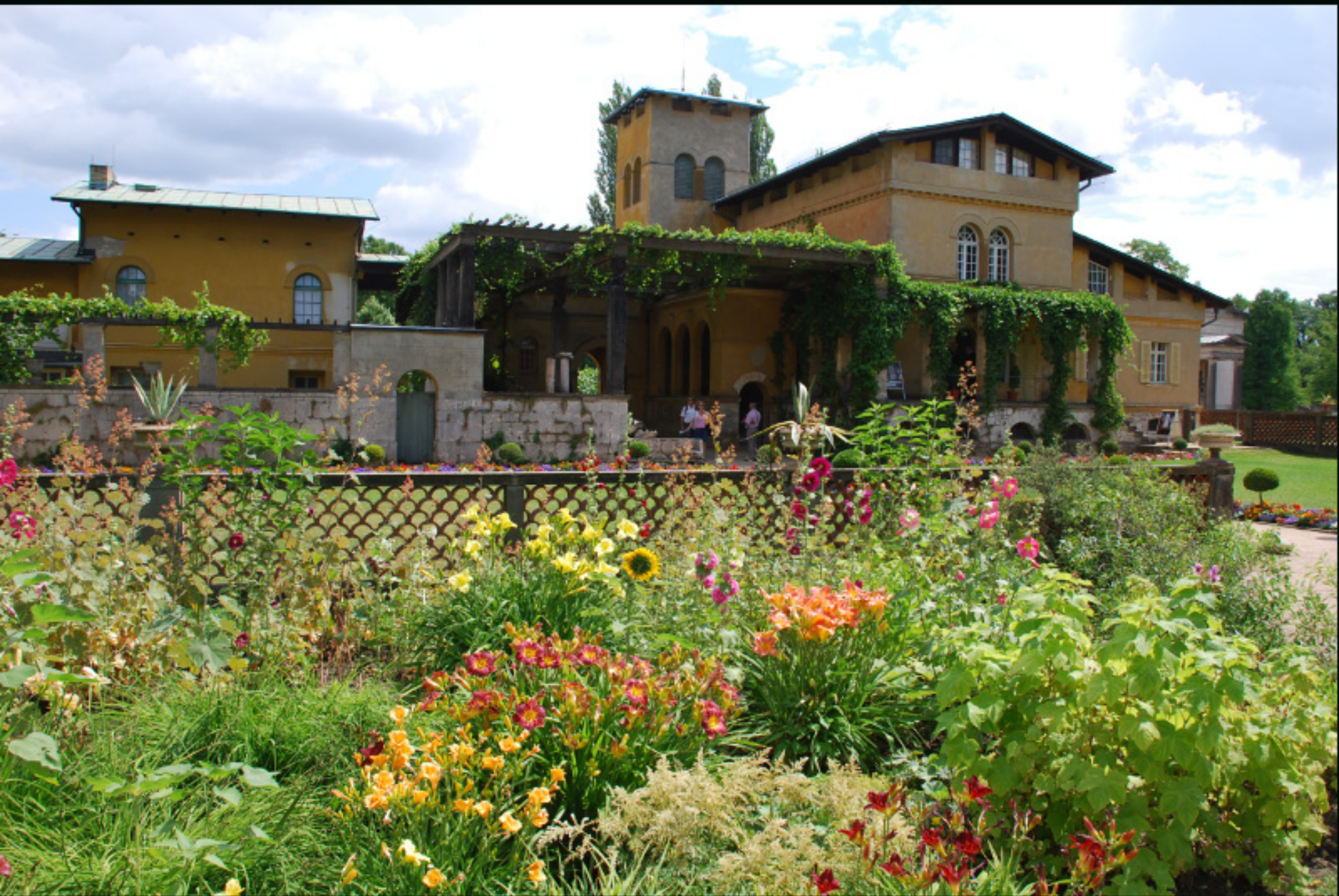
A lovely Italian Villa housing "Roman Baths"