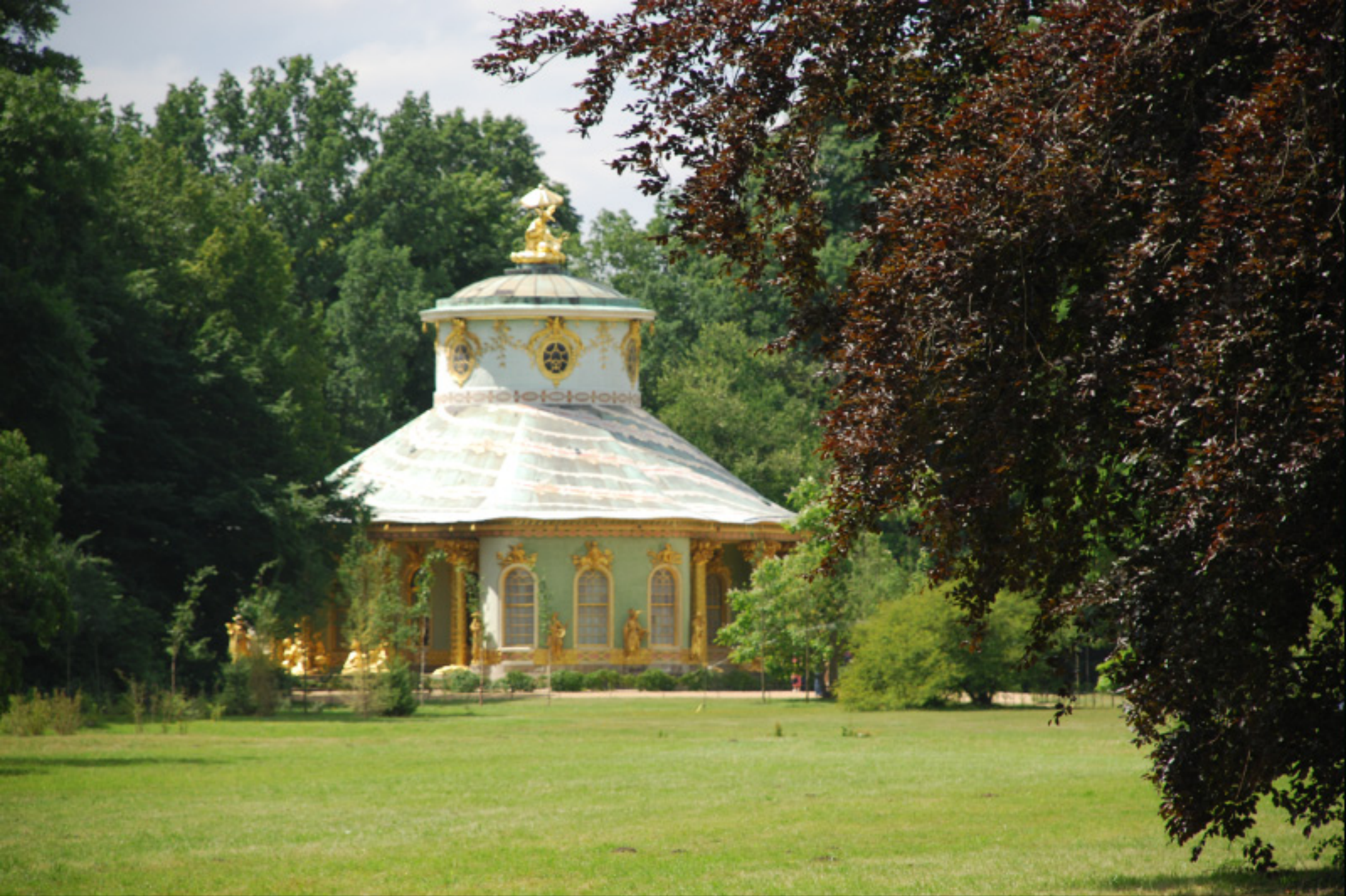
The Chinese Tea House, 1754