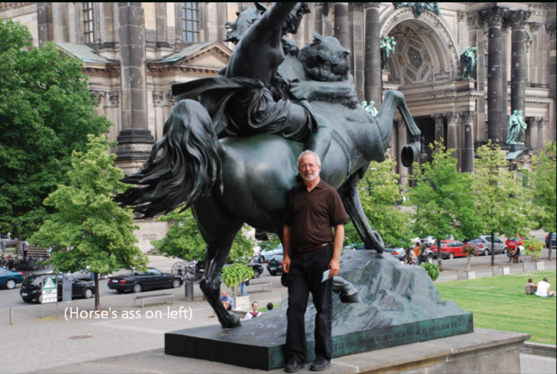
(Horse's ass on left)