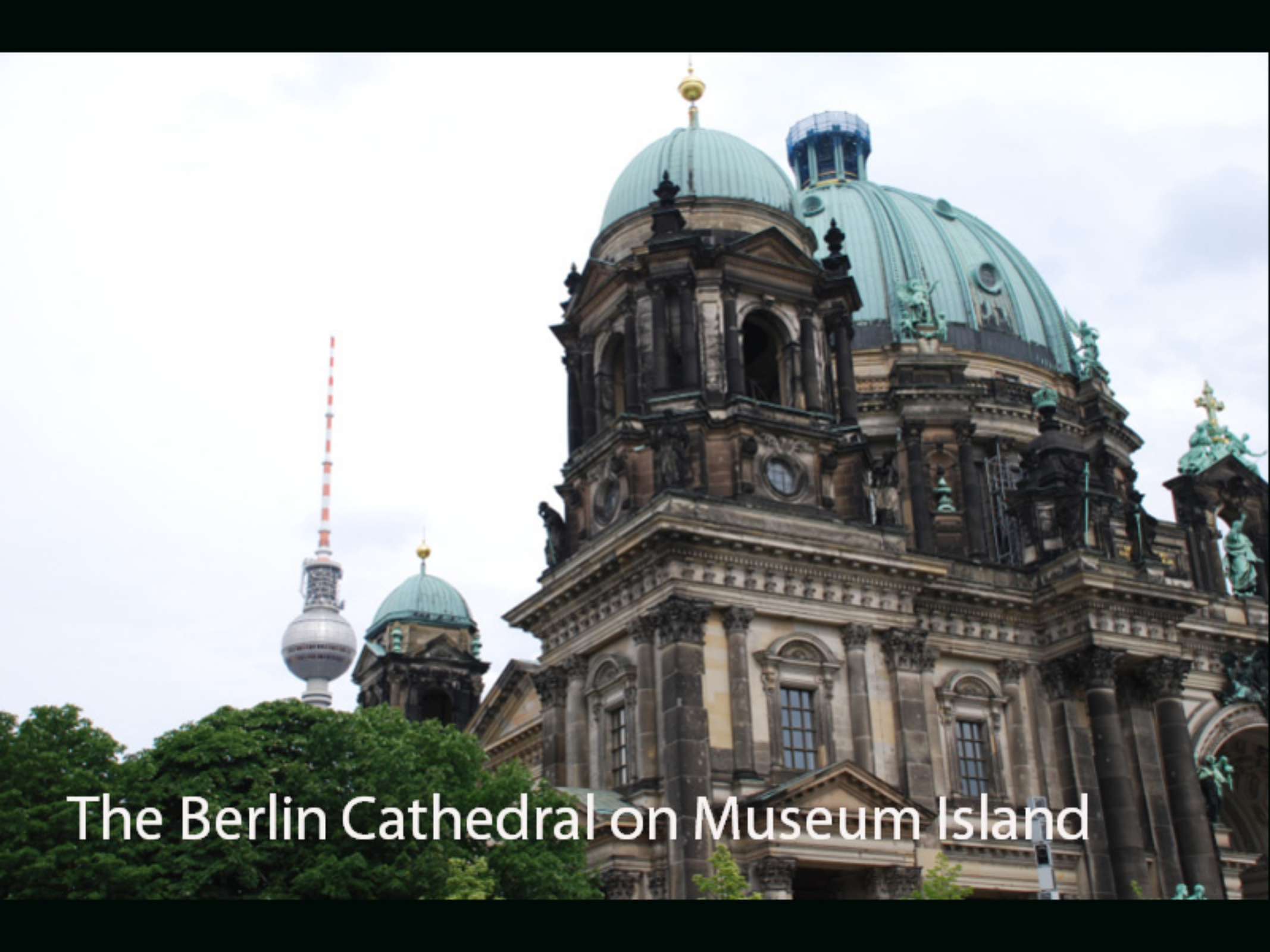
The Berlin Cathedral on Museum Island