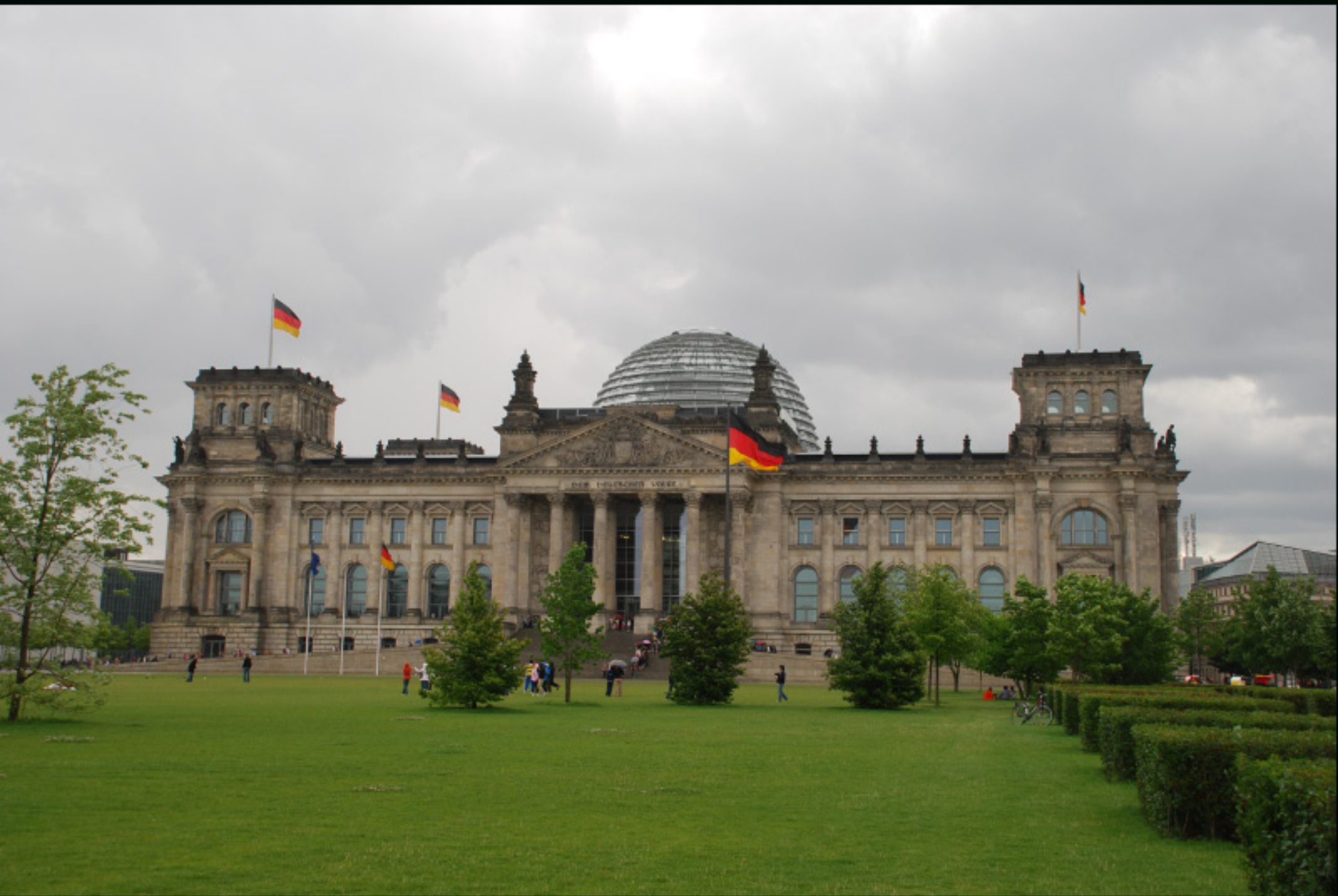
The Reichstag, home to Germany's parliament