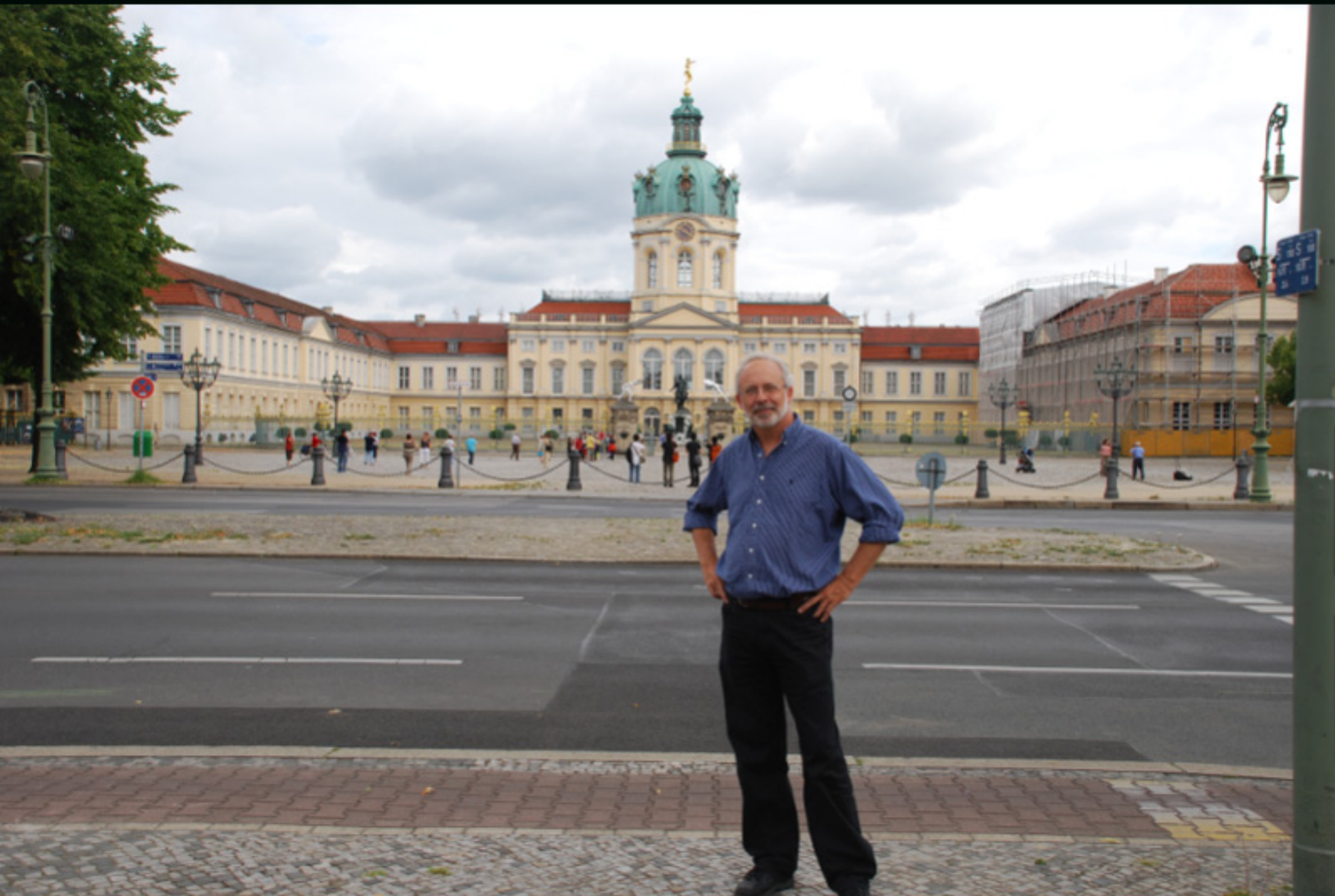
Schloss Charlottenburg, summer residence for a queen