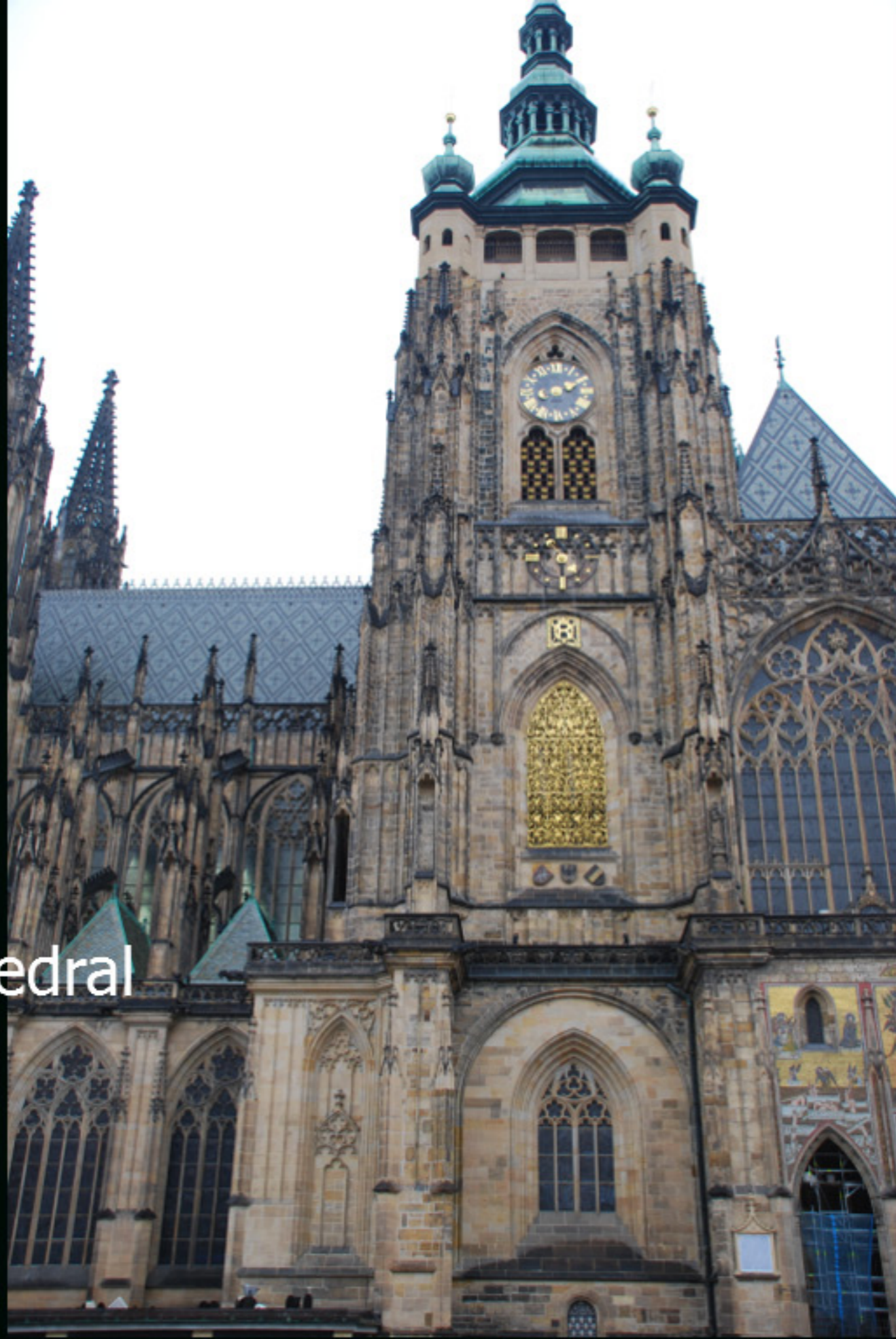
St Vitus Cathedral