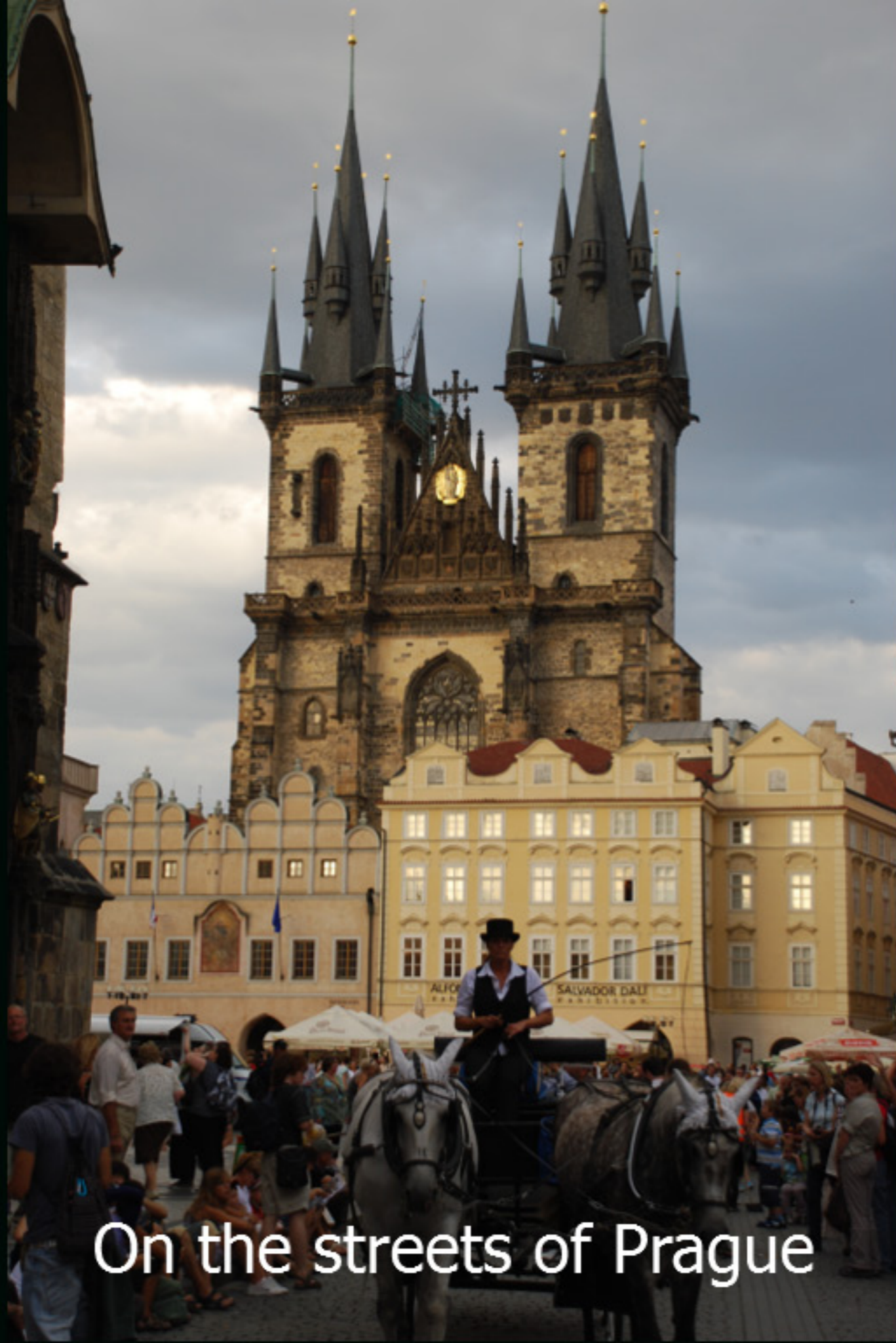
On the streets of Prague