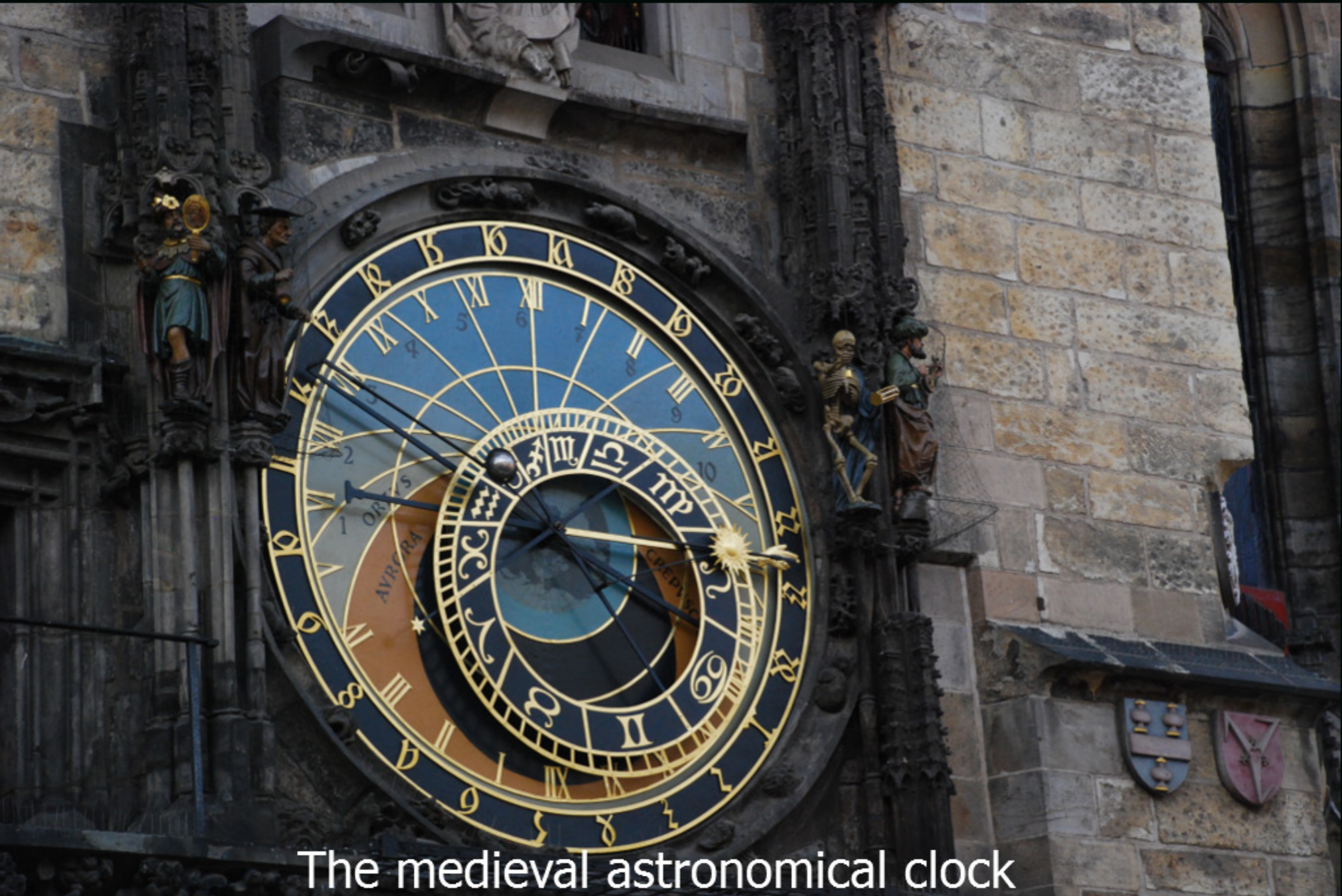
The medieval astronomical clock