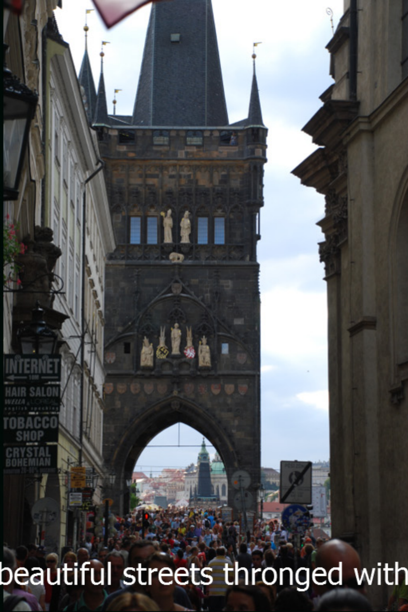
Prague: beautiful streets thronged with tourists