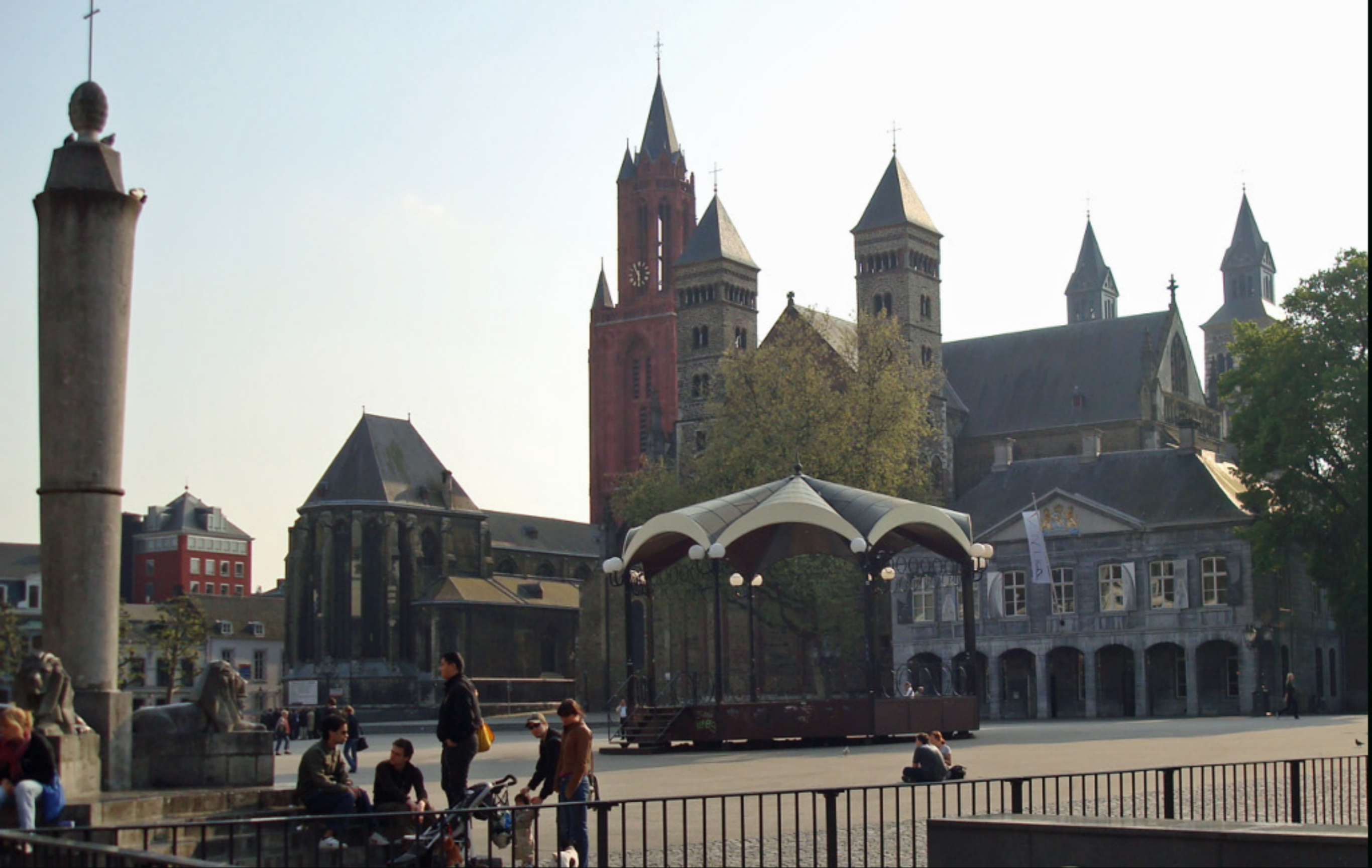
The towers of St. Servatius