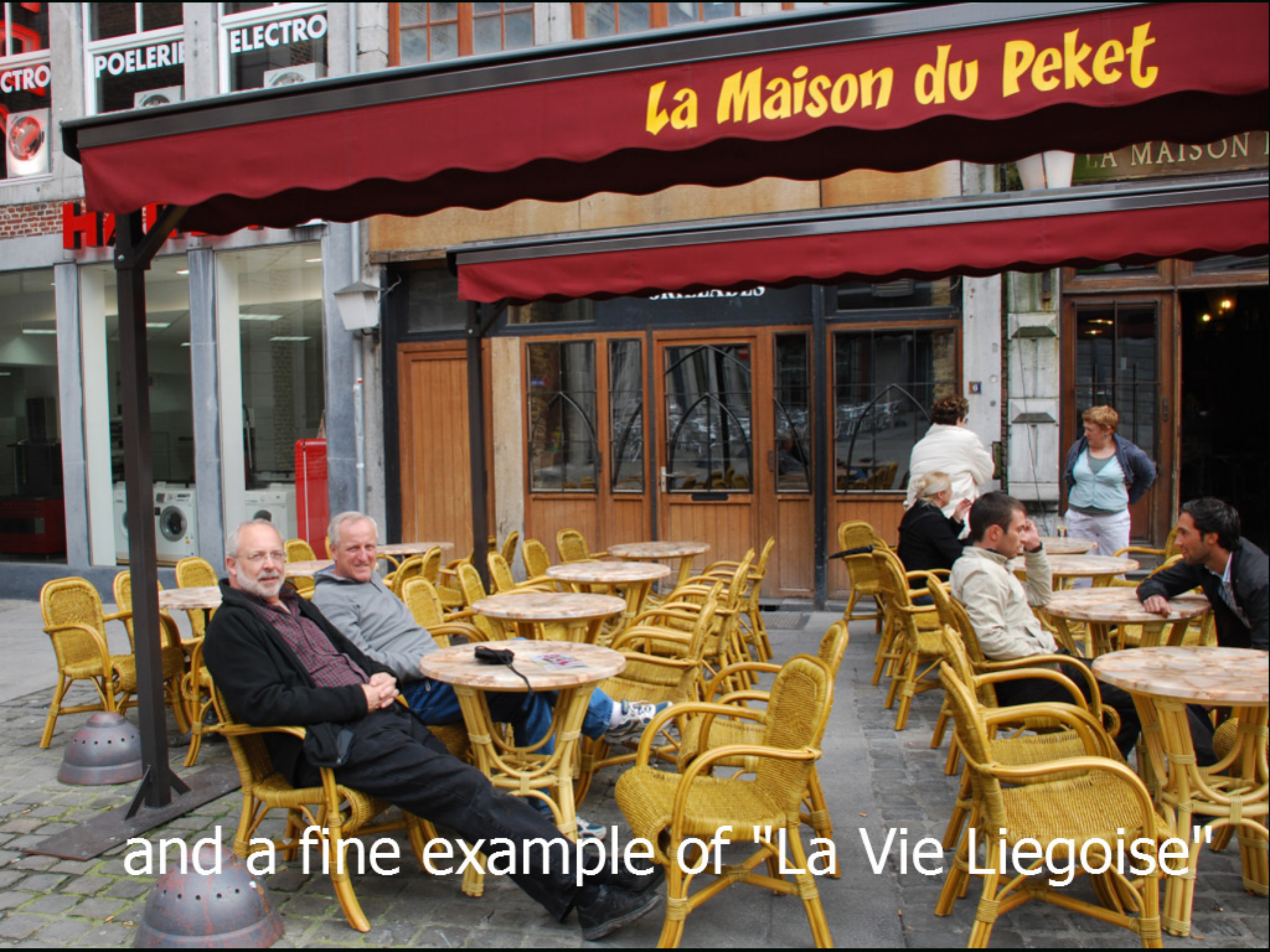
and a fine example of "La Vie Liegeoise"