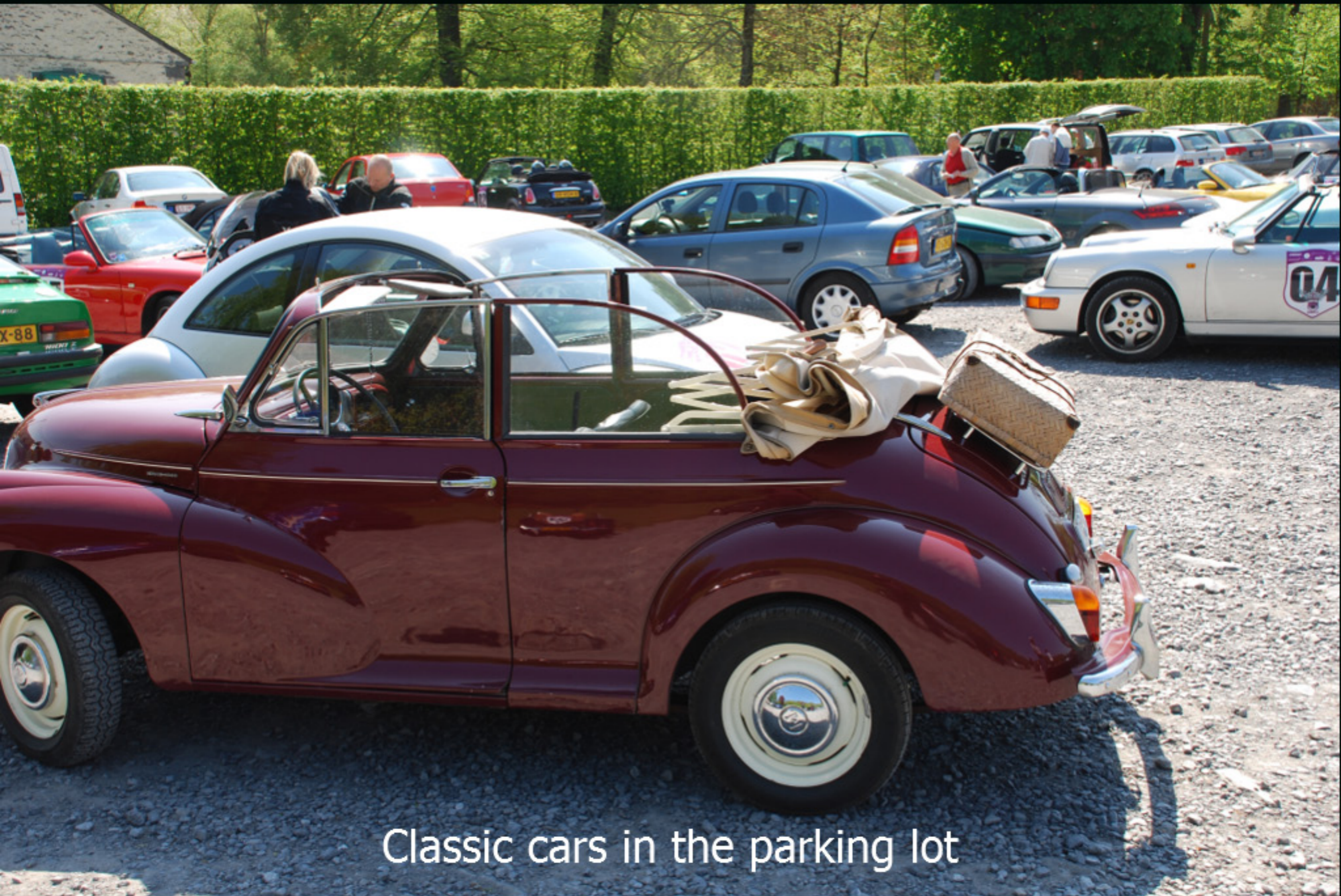
Classic cars in the parking lot