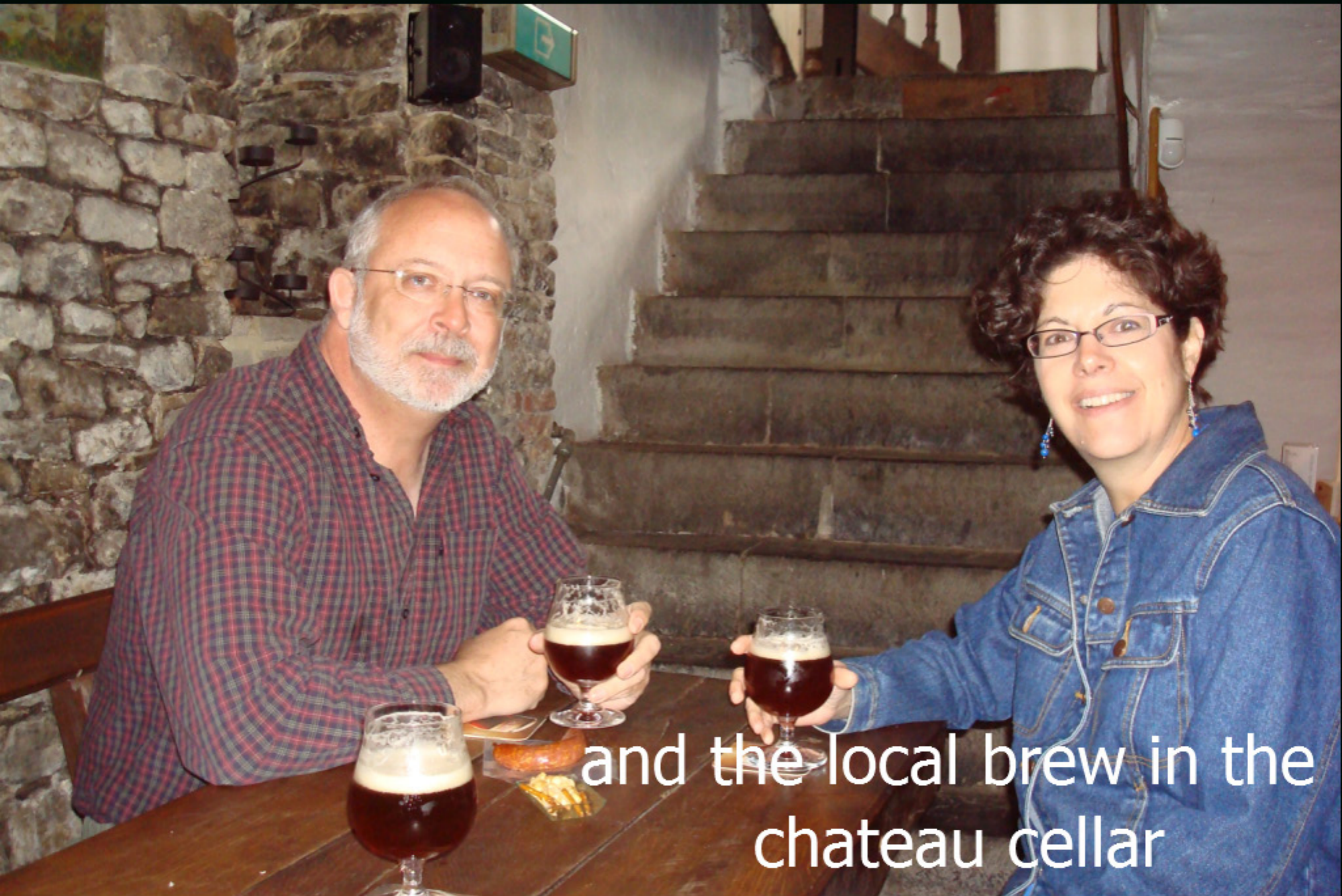
and the local brew in the chateau cellar