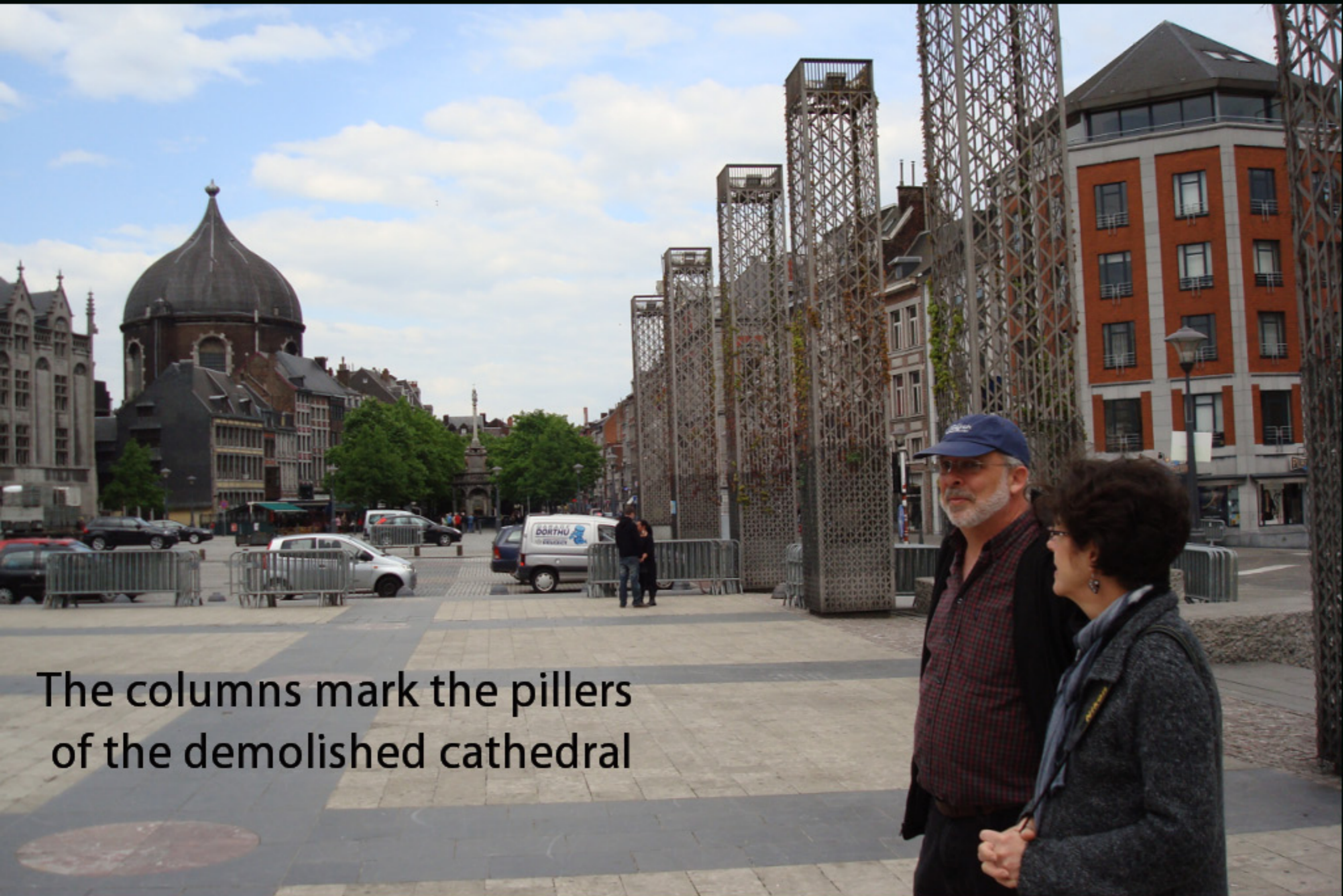
The columns mark the pillars of the demolished cathedral