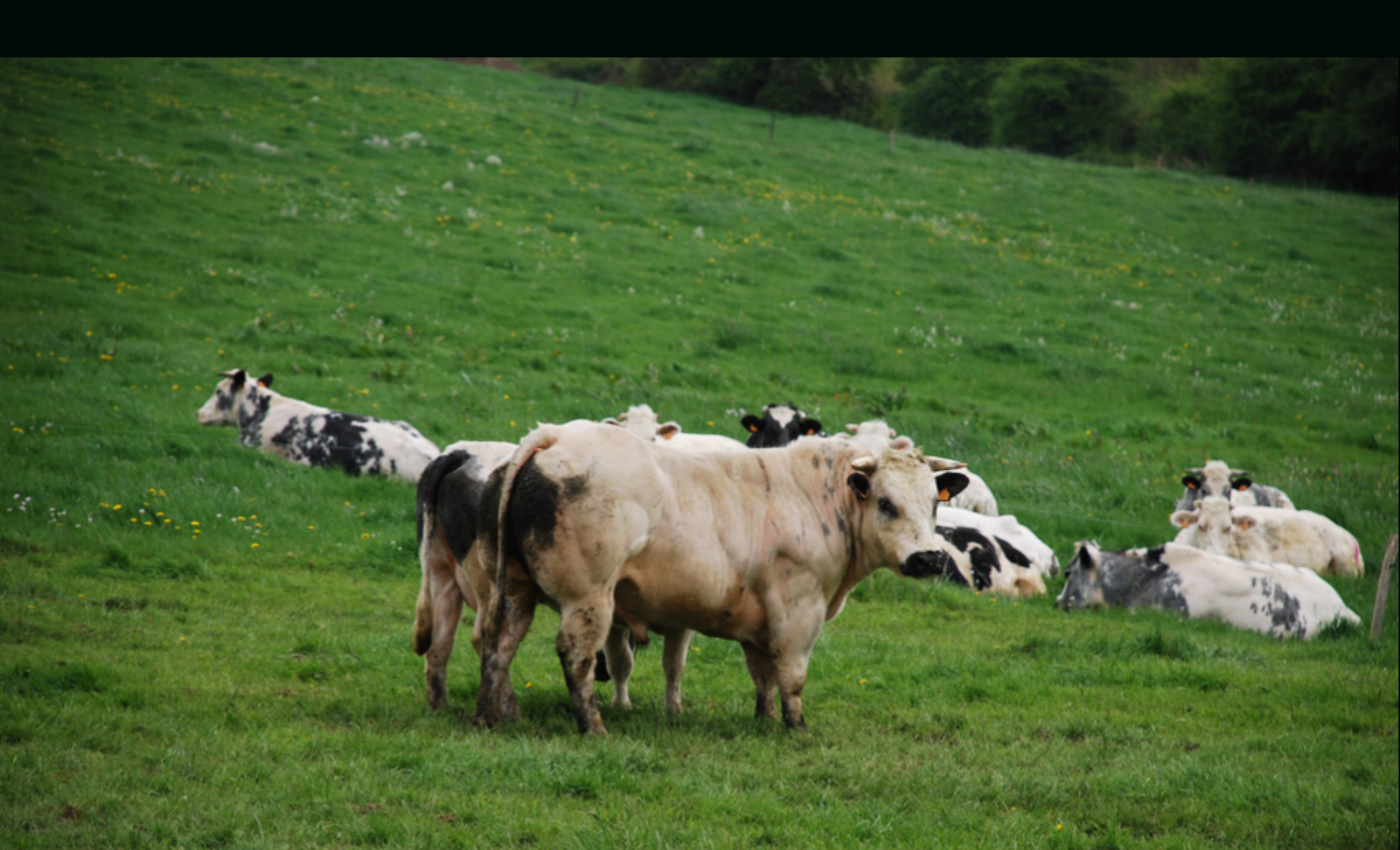
A Belgian Blue bull protecting his harem of contented COWS