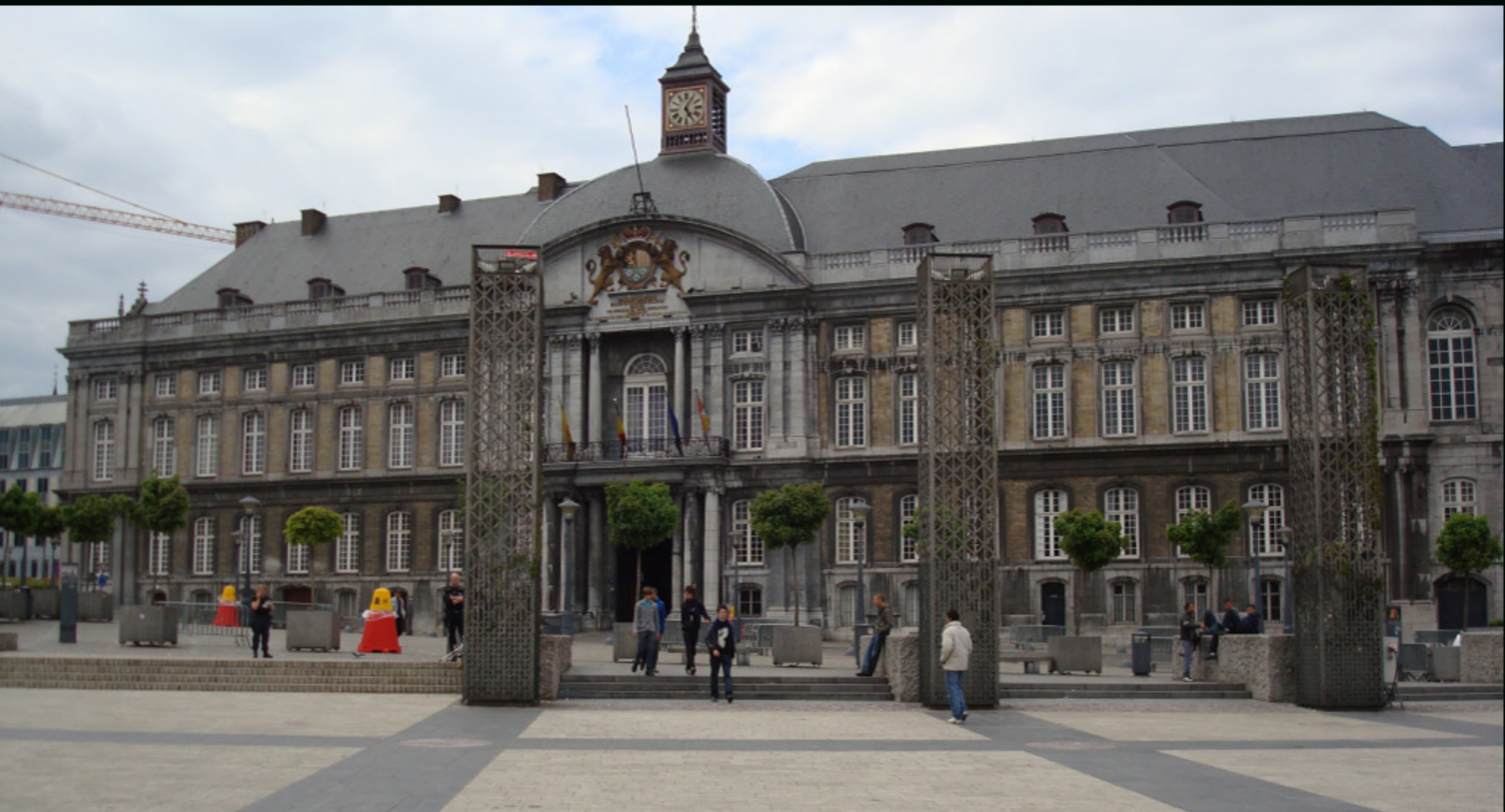
The palace of the Prince-Bishops in Liege