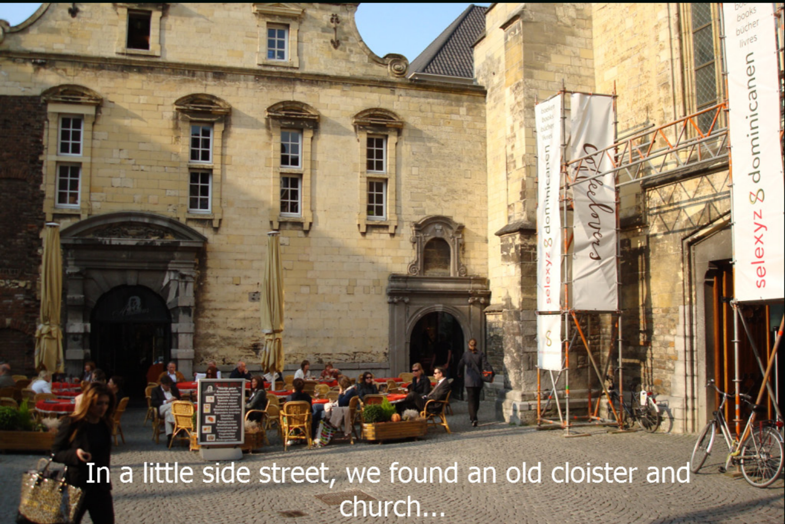
In a little side street, we found an old cloister and church...