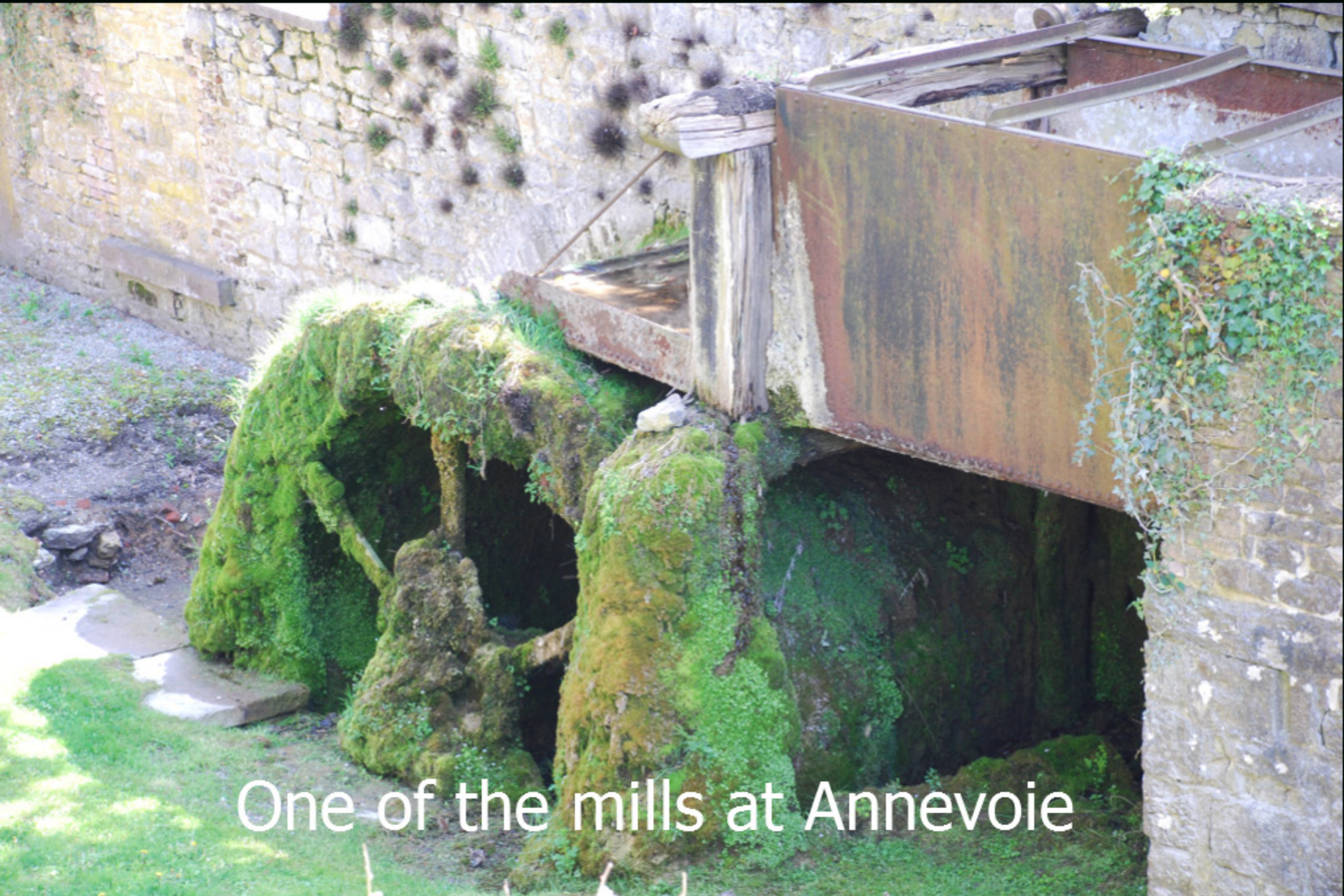
One of the mills at Annevoie