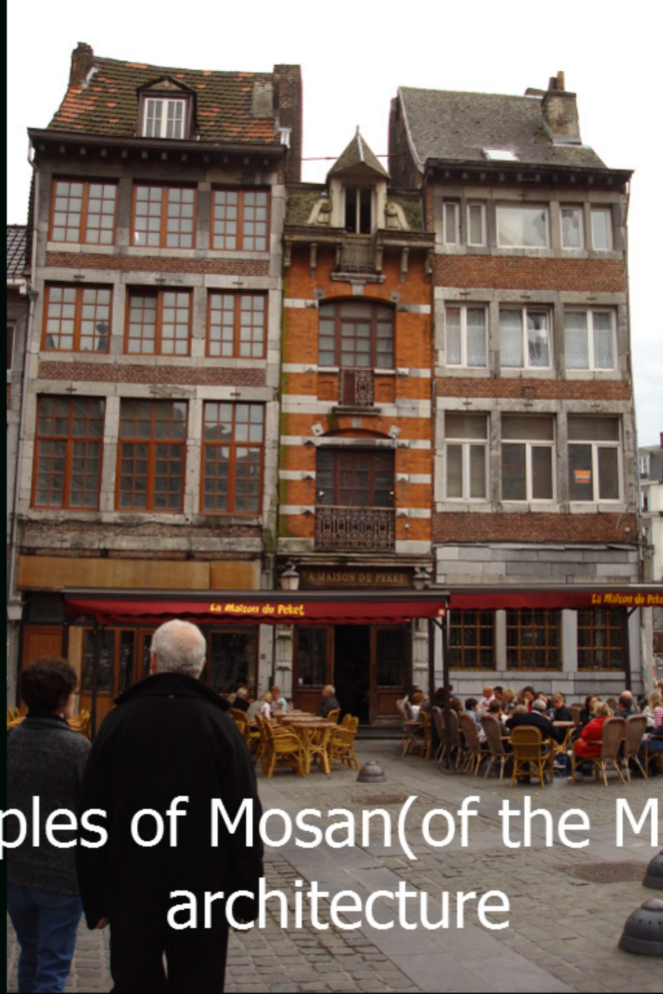
Examples of Mosan(of the Meuse) architecture