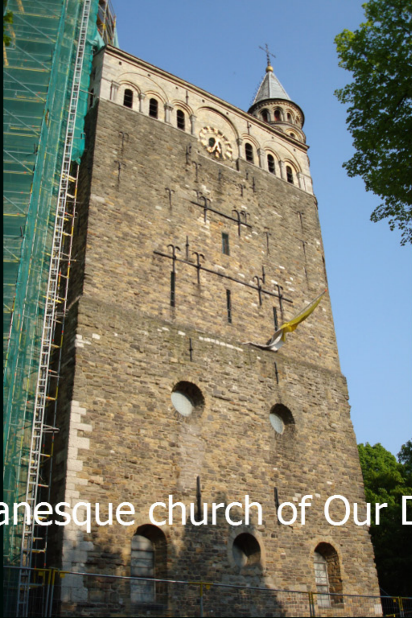
The romanesque church of Our Dear Lady